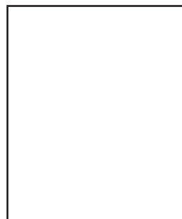
(below) Crafts'n Things bread wraps and wall hangings by Mel Designs