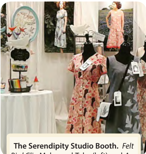
The Serendipity Studio Booth. Felt Bird Clip Make-and-Take (left) and Ava Sundress with Birds in Flight (right)