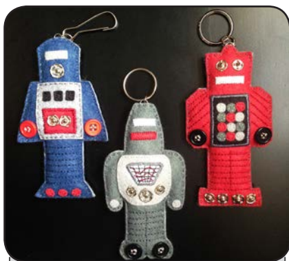
Miniature robots originally published in the Better Homes & Gardens Special Interest Quilts and More magazine.

Pink Retro Telephone Pillow (April 2017). A throwback to the '70s, the decade of avocado appliances and pastel telephones.