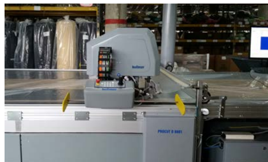
NEW! Bullmer PROCUT Digital Cutting Table for Improved Efficiency

Thank you for your continued commitment and loyalty. We recognize that our customers are the driving force for our organization. We will always strive to exceed your high expectations. After 113 years we are still improving and getting better all the time!